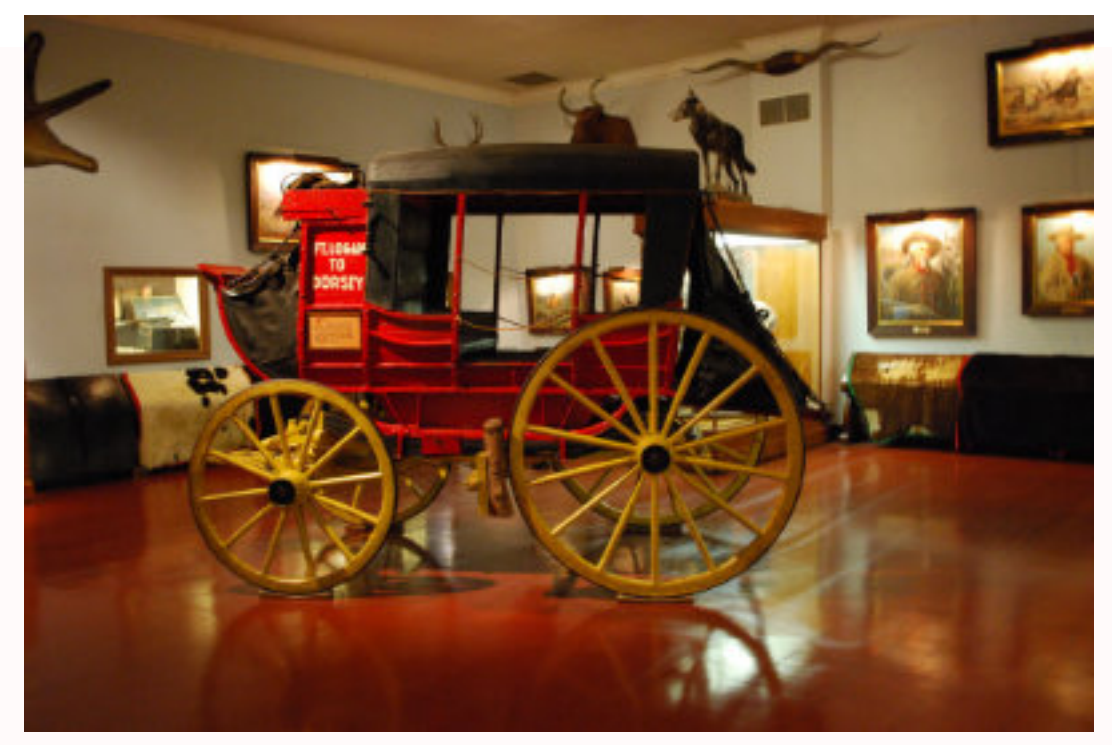
Photo: An original Overland Stage preserved at the Woolaroc Museum in Oklahoma.

constant swaying motion while the stagecoach was moving. Mark Twain described riding in one of these coaches like this: