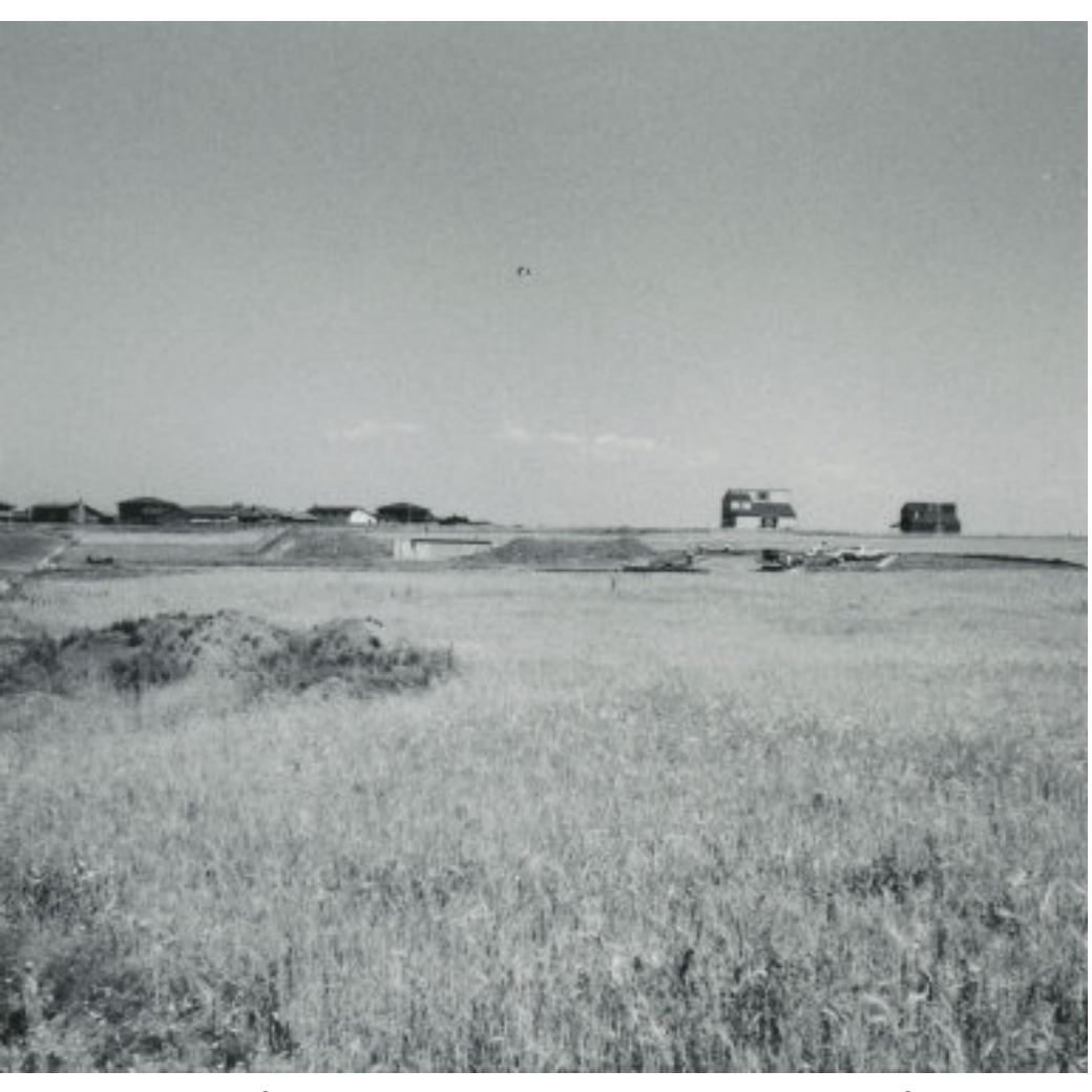
Figure 2: Broomfield c. 1970: no broomcorn in sight.