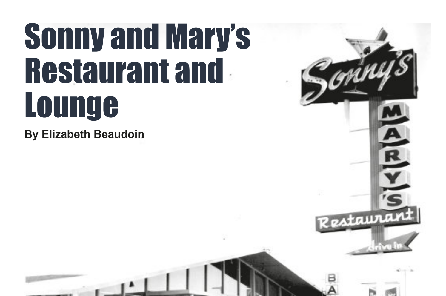
Sonny and Mary's Restaurant and Lounge, 1960.

The building at 7510 West 120th is one of Bromfield's earliest restaurant buildings still standing. In 2023 it is currently home to Great Scotts Eatery, a restaurant that features nostalgic 1950s kitsch as part of its décor, an appropriate choice for this structure completed in 1960. But in 1960 its sleek modern design was the height of fashion. The building reportedly cost $125,000 to construct (for reference the houses in First and Second Filing were selling for around $17,000). The first