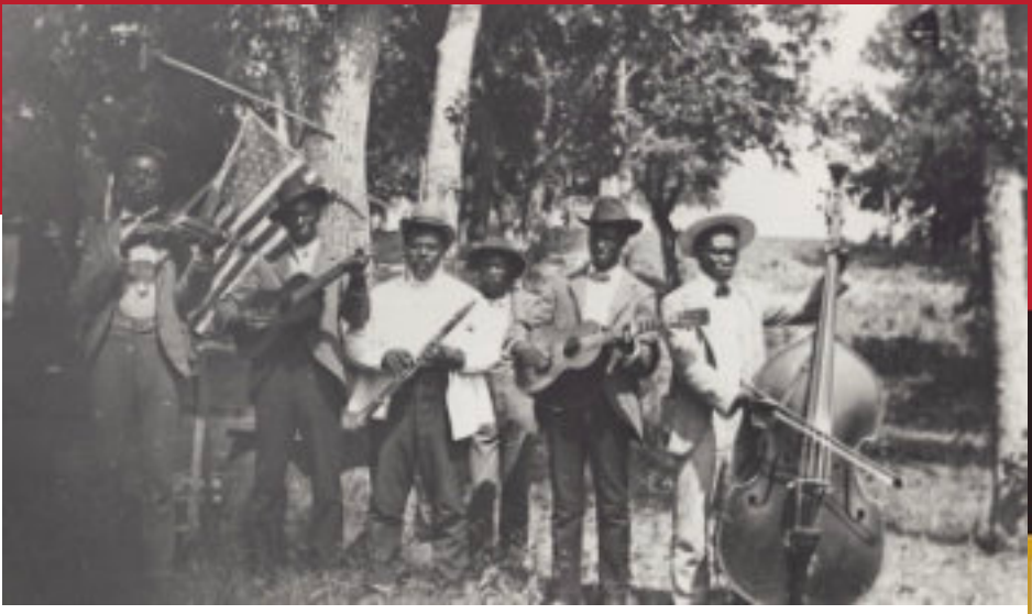
A Juneteenth band in Austin, Texas in 1900.

This year, Juneteenth is a federal holiday celebrated on June 19th. Denver has been the site of the Juneteenth parade and celebration, starting in the 1950s, so there is also some local connection to the holiday. There isn't much dispute that the origin of the holiday can