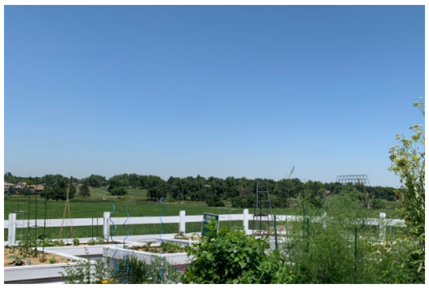
Broomfield's popular open space, "The Field," with the Brunner Farmhouse Teaching Garden in the foreground.

those that might be ecologically or environmentally sensitive. But to the surprise of urban planners and community development offices, grassroots contingencies of citizens began to campaign for the inclusion of open spaces within city limits simply for the purpose of having areas of "relief" from urbanization. And this is exactly what happened in Broomfield.