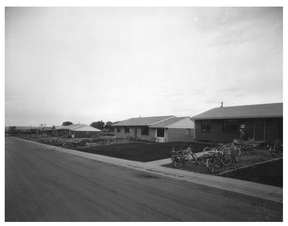
Cottage Schools in 1956 with bikes out front

A Young City Needs Schools--and Fast! Broomfield's Cottage Schools 1956-1958