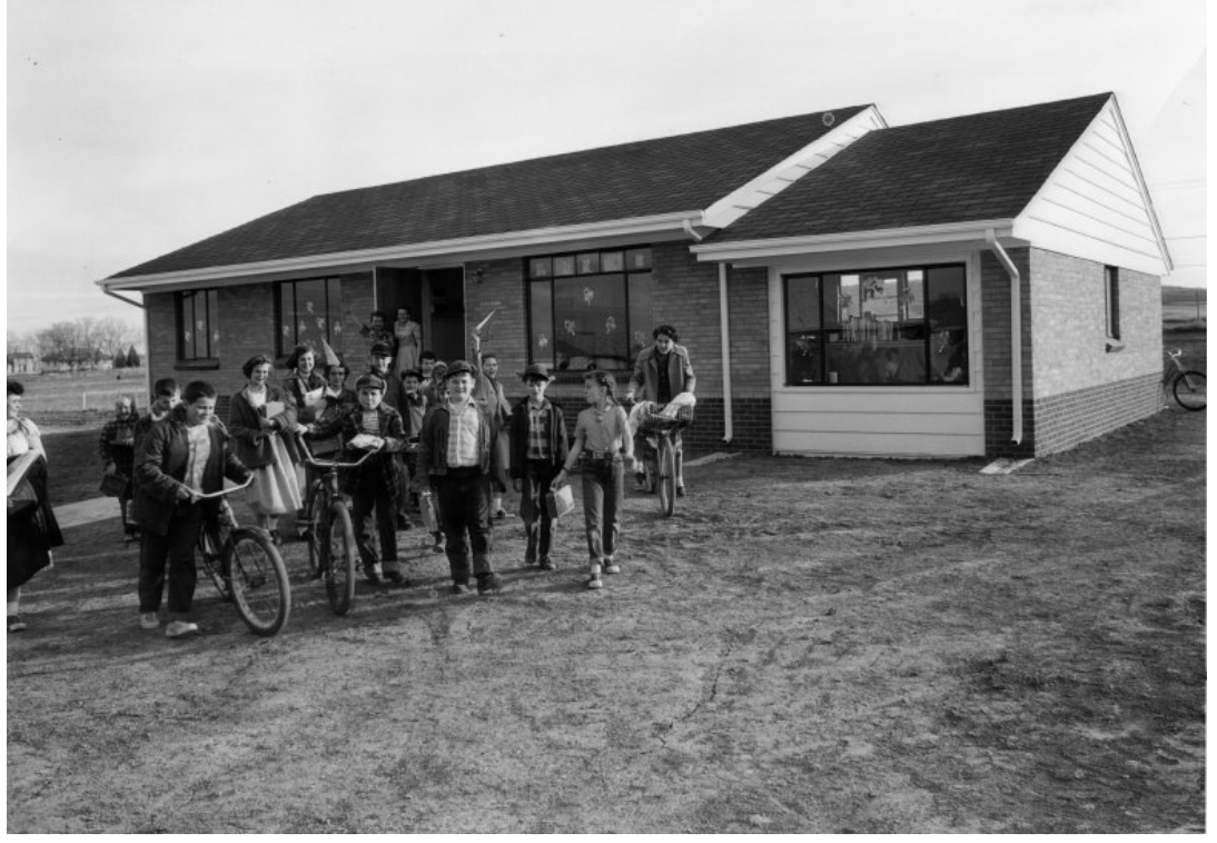
Cottage school in 1956