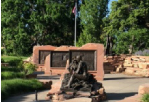
Broomfield 9/11 Memorial

Walk .1 miles or 3 minutes east up Community Park Road from the Library to the Broomfield 9/11 Memorial. The Memorial features three bronze statues, one incorporating a piece of steel from one of the fallen Twin Towers. The statues represent the firefighters, police officers and civilians who helped one another through the tragedy. There are also six bronze panels which represent each of the three sites of the plane crashes and include the names of those who died on September 11. The Memorial was designed and built by Reynaldo "Sonny" Rivera and was dedicated on Sept. 10, 2006.