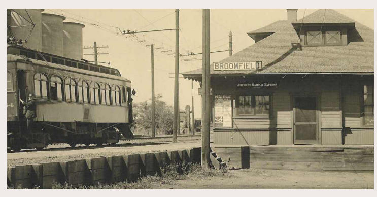
Broomfield Depot, 1914

In 2020, the Friends of the Broomfield Depot Museum changed their name to the Friends of Broomfield History. They did this to reflect their changing focus towards creating broader connections to the history of Broomfield. In the wake of the pandemic, they shifted their ACS funding away from a Speaker