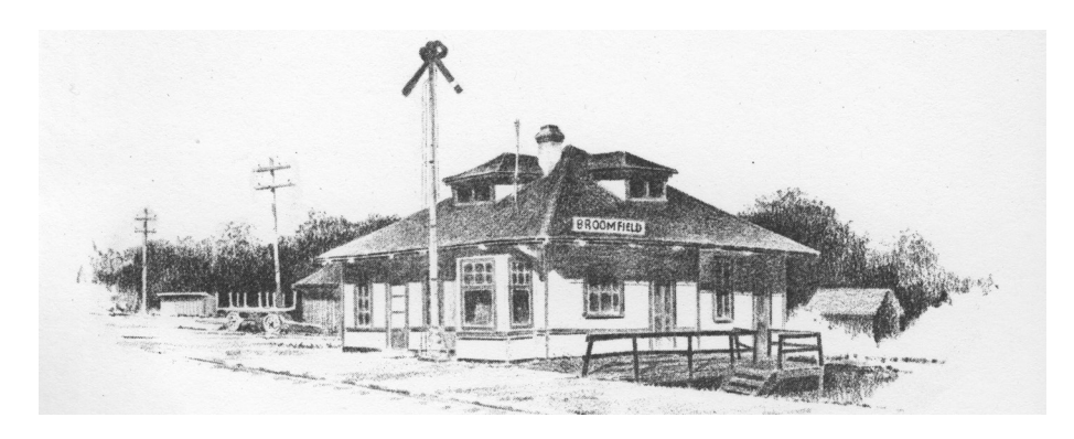
Friends of Broomfield History Membership Form

"Be in! Be appreciated! Be connected! Join today!"